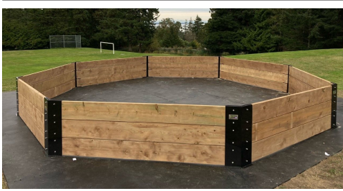
The new Gaga ball court

Please reach out to your child's classroom teacher if you would like a face-to-face appointment. The district has advised us to make virtual or outdoor appointments where possible. In the event you are coming into the school, all visitors must complete the <u>Visitor Sign-in/Health Check</u> ahead of time. Thank you!